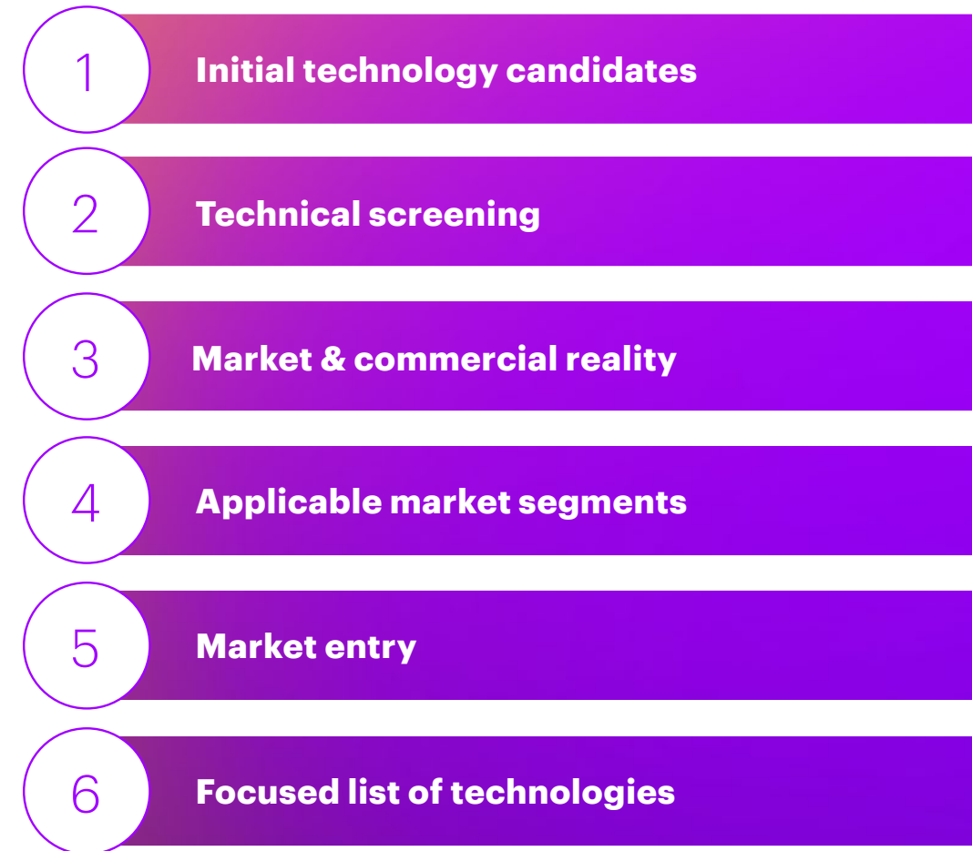
Figure 1—Aircraft technology decarbonization selection methodology

In aerospace, many onboard aircraft technologies have the potential to reduce carbon emissions. Our methodology (Figure 1) accounts for key aspects: specific improvements attributable to each technology, which market segments the technology will be mobilized in, and fleet size/flight operation characteristics for different aircraft market segments.