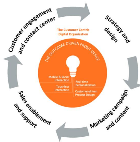
Exhibit 1: The customer-centric digital organization must be free of siloes and aligned to the same outcomes

There are very few firms that can deliver on services across the entire customer engagement value chain, and across the continuum from tactical and operational to strategic and creative. A front office design that actually caters to customers in a personalized way and drives business outcomes must be free from siloes, and make insights as well as creative assets easily accessible to present in the right time and place (Exhibit 1). Thus, one of the greatest challenges companies need help with is filling in the gaps between their agency and internal staff for getting content to market with quality and speed. It is increasingly complex to engage with B2B customers effectively across all touchpoints and channels in a personalized way. Accenture has the potential to bridge the gap between design and brand activation, as well as intelligently and cost-effectively execute on the operational pieces of engagement, marketing and sales.